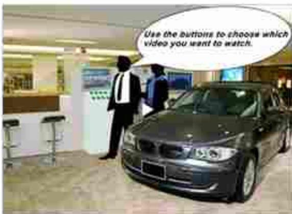
Car Show Room