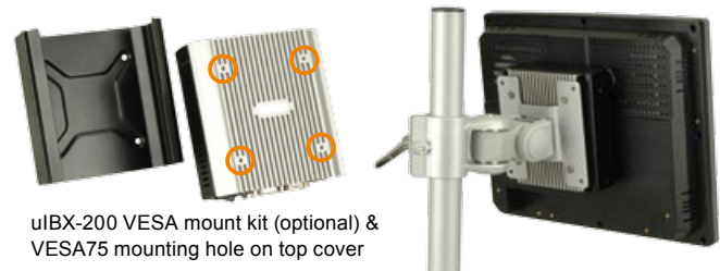
uIBX-200 VESA mount kit (optional) & VESA75 mounting hole on top cover