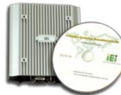
Ultra Compact Fanless Media Box