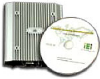
uIBX-200 v.s. CD disk

uIBX-200's compact design makes it fit for any field installation. 120mm x 125mm x 44.4mm in physical size can mounted perfectly behind a 7" LCD monitor.