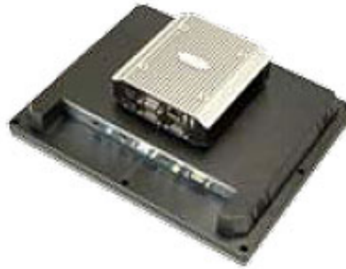
uIBX-200 v.s. 10.4" AFL multimedia monitor