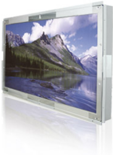
46" Open Frame