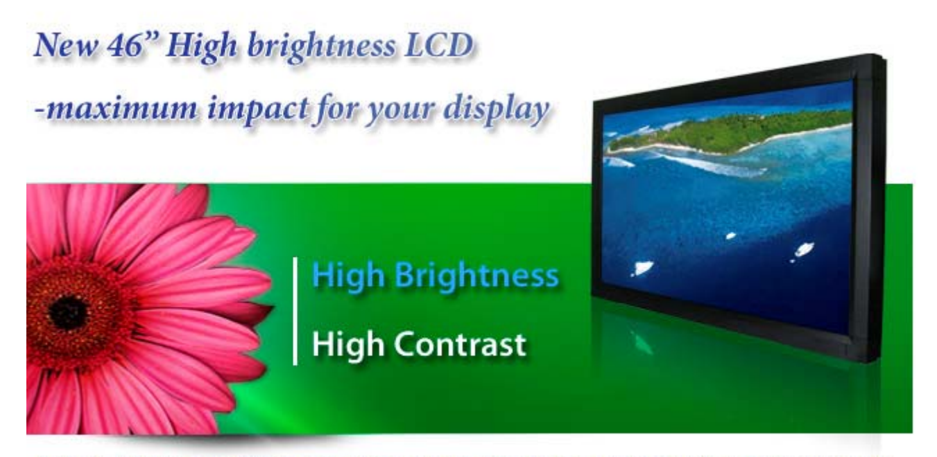
1500 nits brightness and 3000:1 contrast ratio assure excellent visibility even in bright outdoor environments.

Winmate has launched the new high brightness LCD providing excellence in the use of digital signage. It replaces outdated poster advertisements in transit centres, bus shelters, museums, and shopping malls. With an extreme brightness level of 1500 nits and static contrast ratio of 3000:1, your display will create an impact in outdoor environments for a variety of customized applications.